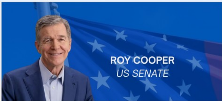
ROY COOPER US SENATE

We support these leaders because their vision will expand opportunity, strengthen accountability, and address the urgent needs of the African American community—lifting all North Carolinians in the process.