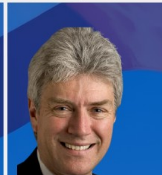
JAMES WELDON WHALEN NC COURT OF APPEALS SEAT 3