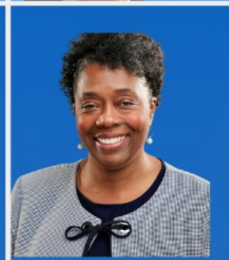
IRISH SPENCER GUILFORD COUNTY BD OF EDUCATION DISTRICT 4