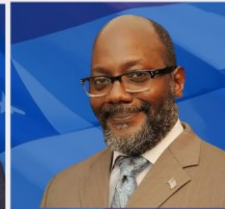
CHUCK HUBBARD US HOUSE DISTRICT 5